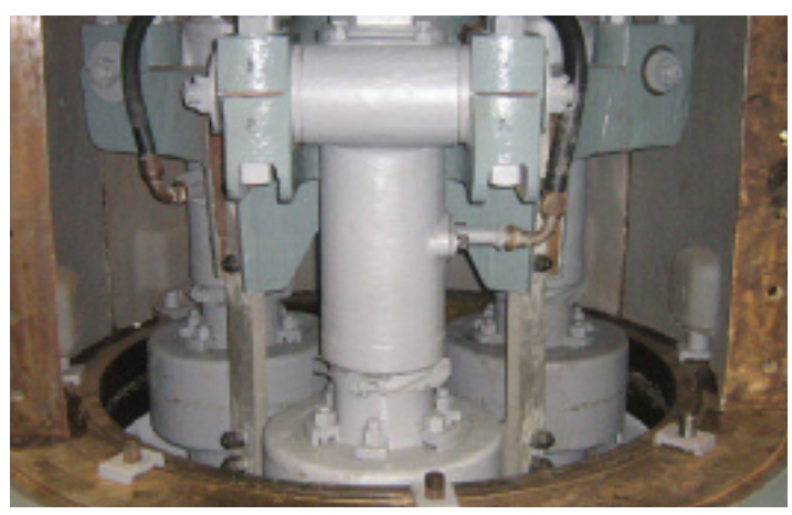
Mill with screens and covers removed.