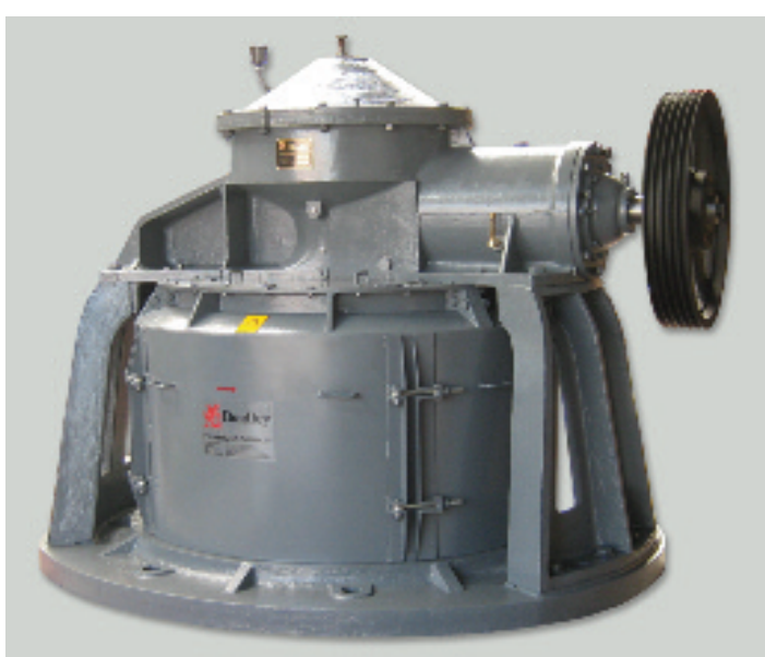
Bradley Pulverizer Hercules Screen Mill.

These Hercules Screen Mills are well proven in quarries, cement plants and similar heavy duty applications.